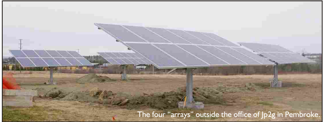
The four “arrays” outside the office of Jp2g in Pembroke.