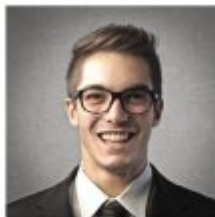
Is addicted to prescription drugs.