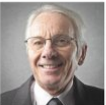
Doesn't have enough savings to retire.