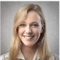
Experiences anxiety all the time.