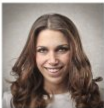
Doesn't know how she will pay student loans.