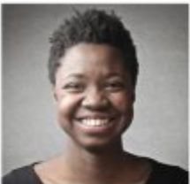
Is struggling to fit in with her new job.