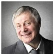
Still grieves the loss of his wife.