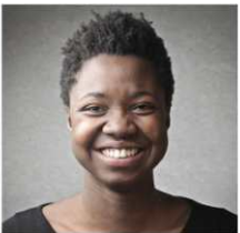
Is struggling to fit in with her new job.