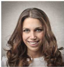
Doesn't know how she will pay student loans.