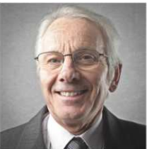
Doesn't have enough savings to retire.