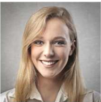
Experiences anxiety all the time.