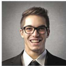
Is addicted to prescription drugs.

Job#DR1301 Kitchen Cabinets 5967 Palmer Road, Palmer Rapids. Awarded to: Sylvestre Woodworking in the amount of $23,830.00.