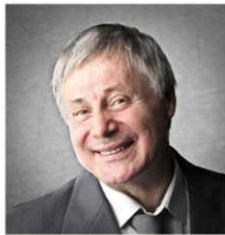
Still grieves the loss of his wife.